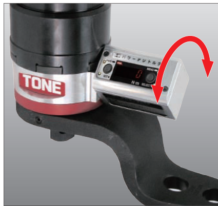
Swivel LED Display for better visual contact.