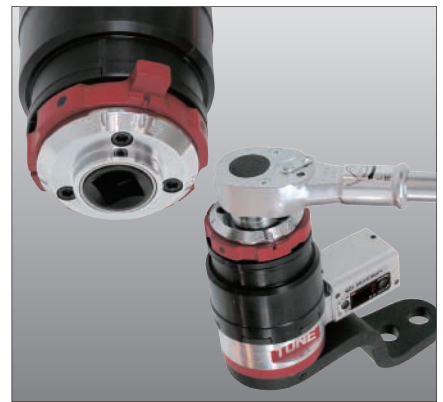
Combination of Anti-Wind-UP Clutch and Ratchet handle improves workability as well as protects operator from spring back force of the gears.