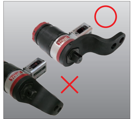
Reaction plates must be placed parallel to the display to protect display from damage.