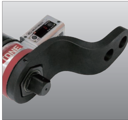
Straight and Offset type reaction plates are included as standard accessory. Custom made reaction plates are also available.