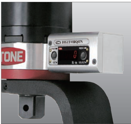
Eyes-friendly RED LED for better visual contact in outdoor and at the night.